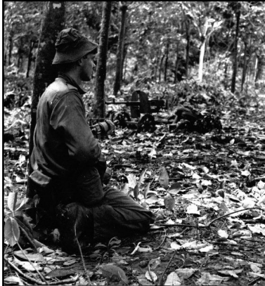
The Battlefield - 1966

45 Exhibition Street, Melbourne, 3000. Ph: (03) 9654 4000 Fax: (03) 9654 7333 ABN 76 004 937 099 Licence 30280 Web: www.nntravel.com.au Email: judi@nntravel.com.au